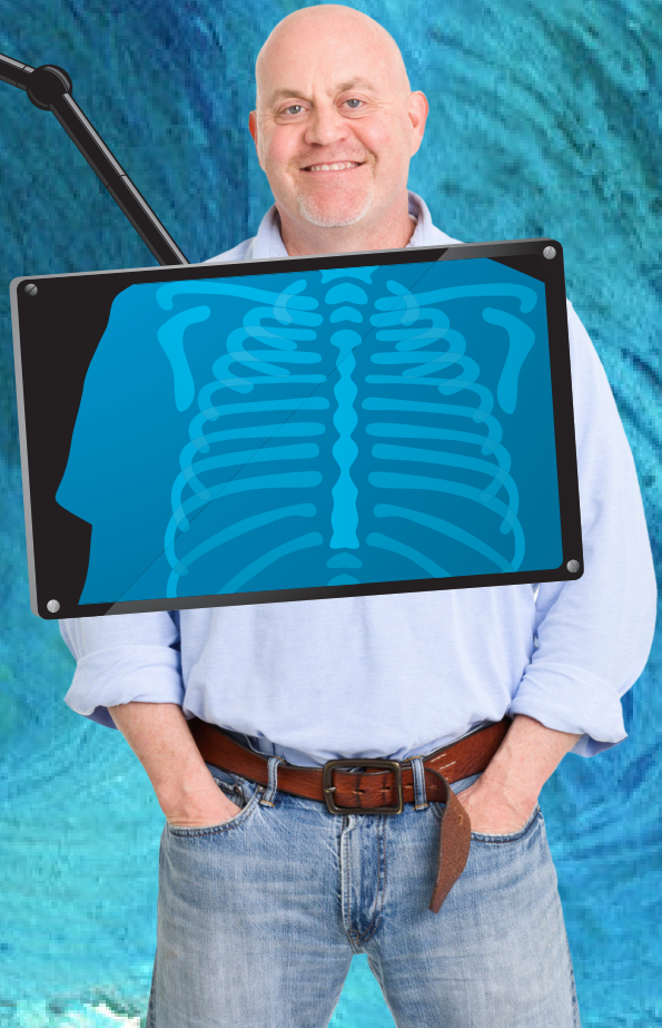
Photo ©iStockphoto.com/drimages Illustration ©iStockphoto.com/mustafahacalaki

It's no secret that too much weight can have an impact on your health. Just look at the list of problems associated with obesity: